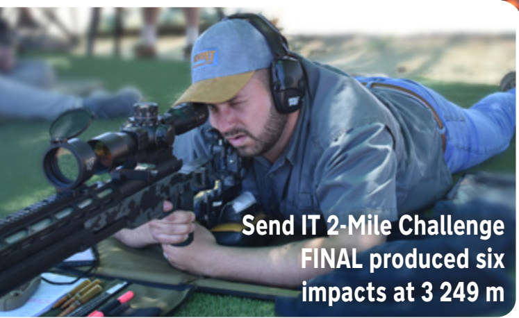
Send IT 2-Mile Challenge FINAL produced six impacts at 3 249 m