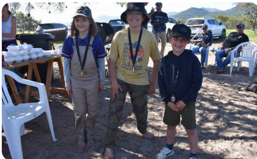
▲ Junior Winners