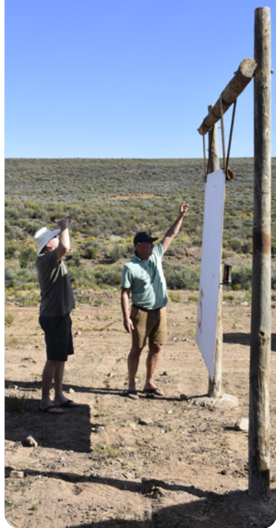
▲ Target viewing, 19 Jan 2024, 2-Mile Challenge